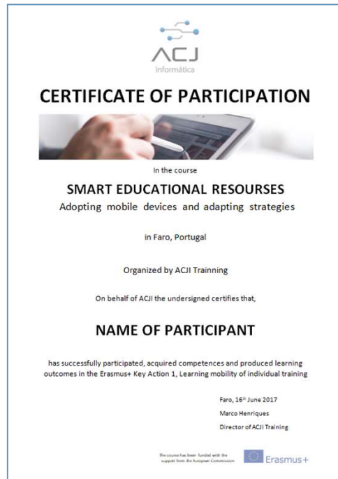
Certificate of Participation Issued by ACJI Signed and stamped by ACJI